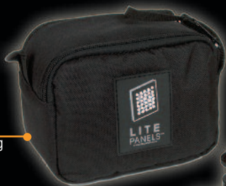
Padded Carrying Bag

Note: Handycam Shoe Adapter available at video resellers