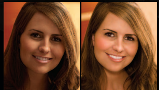
Without Litepanels MicroPro