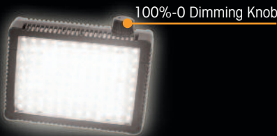
100%-0 Dimming Knob