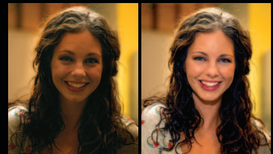
Without Litepanels Micro