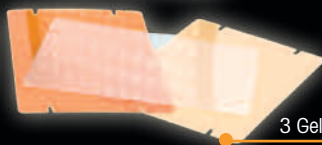
3 Gel Filters